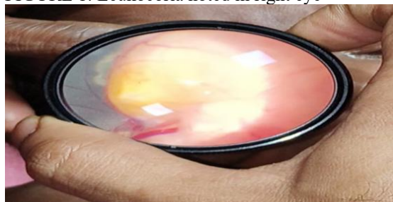
FIGURE 2 : whitish elevated mass noted in the posterior pole temporal to the disc of 5 DD.