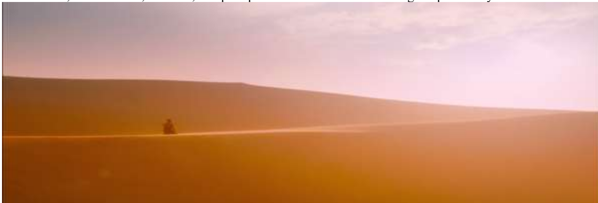
Figure 03: Scene from Mad Max: Fury Road , directed by George Miller (2015)

Berger explains that the societies after apocalyptic would-be dematerialized societies full of violence and injustice as the film Mad Max: Fury Road depicts a post-petroleum society where there is dearth of petrol as the physical heat in form of hot weather, the emotional heat of trauma, the heat of unjust violence, and insanity of dictators were causing the post-apocalyptic societies to be dematerialized (Berger, 1999, pp. 32,33). The iconic vehicle of the film is a war rig symbolizing the dearth of fuel in the dystopian post-apocalyptic futuristic world. Mad Max: Fury Road describes post-petroleum situations causing conflict to take control over fuel supplies to get petrol for the vehicles as in post-apocalyptic situations good and speedy transportation is synonymous with safety from all types of dangers. The landscape of settings depicts the bleak atmosphere in Mad Max: Fury Road serving as a backdrop for the action of the film. The desolate landscape provides a canvas to highlight the dilemmas of post-apocalyptic societies including lack of resources, infertile land, toxic air, and post-petroleum situations enhancing the profundity of the film.