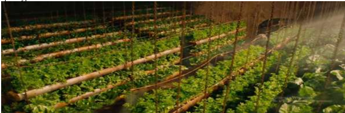
Figure 02: Scene from Mad Max: Fury Road, directed by George Miller (2015)