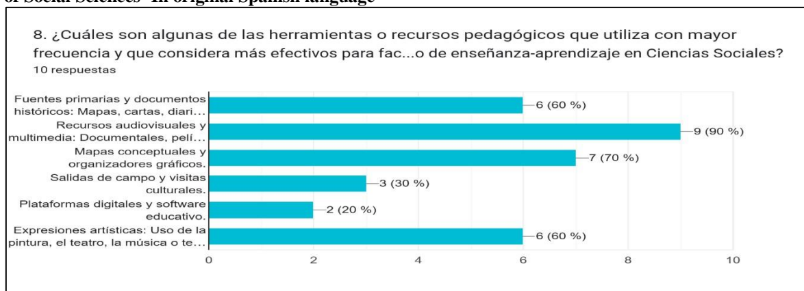
Graph No. 1. Effective pedagogical tools or resources most used by Graduates in the Teaching-learning of Social Sciences- In original Spanish language

This graph No. 1 corresponds to question 8 of the survey carried out virtually among the Graduates (2010 - 2021) of the Bachelor's Degree in Social Sciences of the UPTC, which shows that teachers privilege visual and experiential resources such as audiovisuals (90%) and graphic organizers (70%), which reflects a commitment to strategies that facilitate the understanding of historical and social phenomena in a clear and attractive way. Likewise, the use of primary sources and artistic expressions (both with 60%) shows a tendency towards critical, interpretive and creative teaching, incorporating real documents, contextual analysis and expressive languages to strengthen social thinking. In contrast, field trips (30%) and digital platforms (20%) appear less frequently, suggesting institutional, technological, or logistical limitations that make their implementation difficult. Overall, the results reveal that teachers value resources that promote analysis, reflection, and active participation, although they still face challenges in fully integrating experiences in the territory and advanced digital tools.